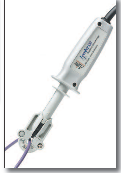
Figure 5: Measuring wire current

The very small size of the field sensor within the I-prober 520 gives it some