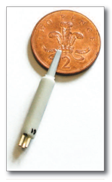
Figure 2: Miniature fluxgate magnetometer for the I-prober 520

established principle of a fluxgate magnetometer to measure field. This type of magnetometer uses a magnetically susceptible core surrounded by a coil carrying an AC excitation current which magnetises the core alternately in opposite directions. If there is no external magnetic field, this magnetisation is symmetrical. When an external field is applied, the resulting asymmetry is detected by a feedback loop which applies an opposing current through the coil to restore the net field to zero. The output voltage is proportional to this opposing current, and therefore to the magnitude of the field.