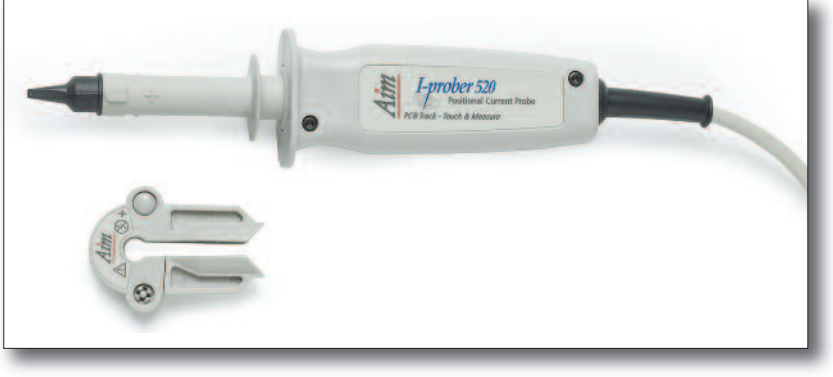
Figure 4: Clip-on toroid assembly for measuring current in a wire

of the I-prober is the observation of currents flowing within ground planes. Whereas quantitative measurements are not possible (because the current density can not be inferred) it is easy to see whether and where circulating currents are flowing and to find their injection points. Many circuit designs are adversely affected by power and ground connection schemes which fail to provide a true zero impedance connection allowing unexpected interfering signals to appear.