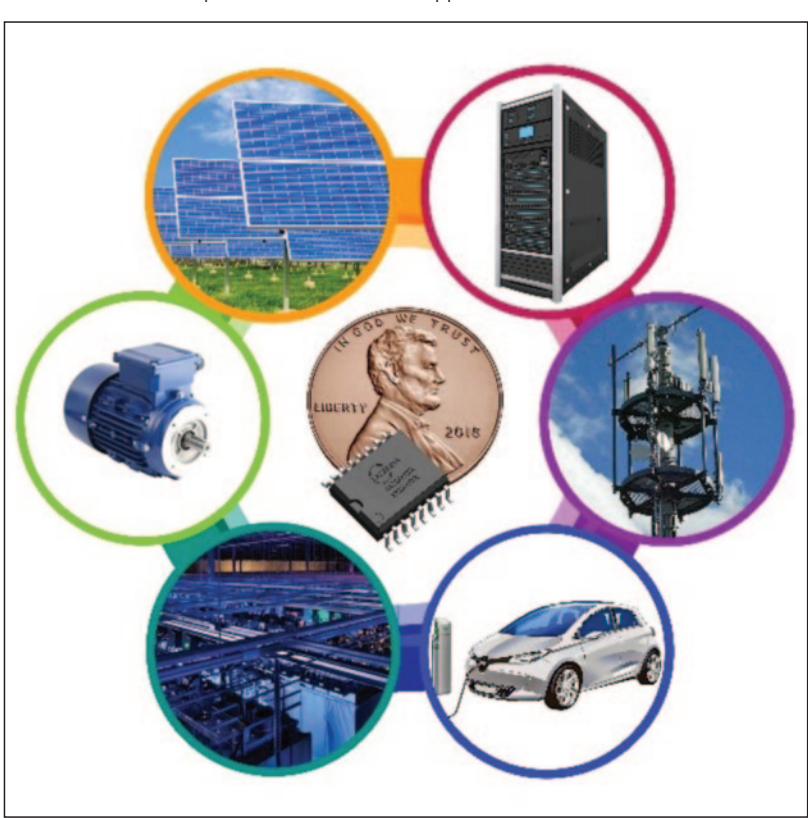
Figure 1: Current sensing technologies are available for a wide range of applications – from EV cars and ADAS systems to home appliances, telecommunications and server farms

Within the sensor, the current flows through a U-bend in the lead frame, where it generates a forward or reverse field measured by two current sensors in the device. By measuring the field from both current directions, the device cancels out the external fields and magnetic anomalies which might be present. This