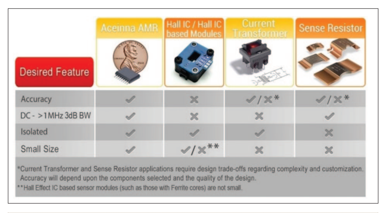
Figure 2: Advantages of AMR based Current Sensing versus other types of current sensing technologies

allows a horizontally-sensing AMR chip to ignore external fields generated from other nearby components on the board.