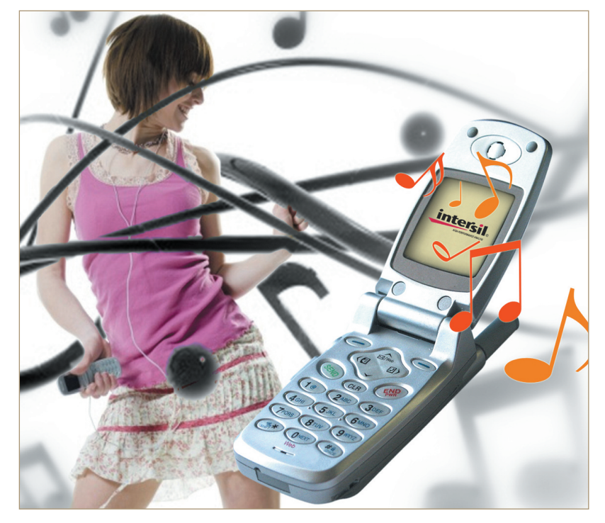
Figure 1: In 2007, the total available market for audio amplifiers alone will be around $200 million, driven by portable devices for the young generation

In a traditional class AB design, the output-stage power dissipation is very large in even the most efficient linear output stage. This difference gives class D great advantages because the lower